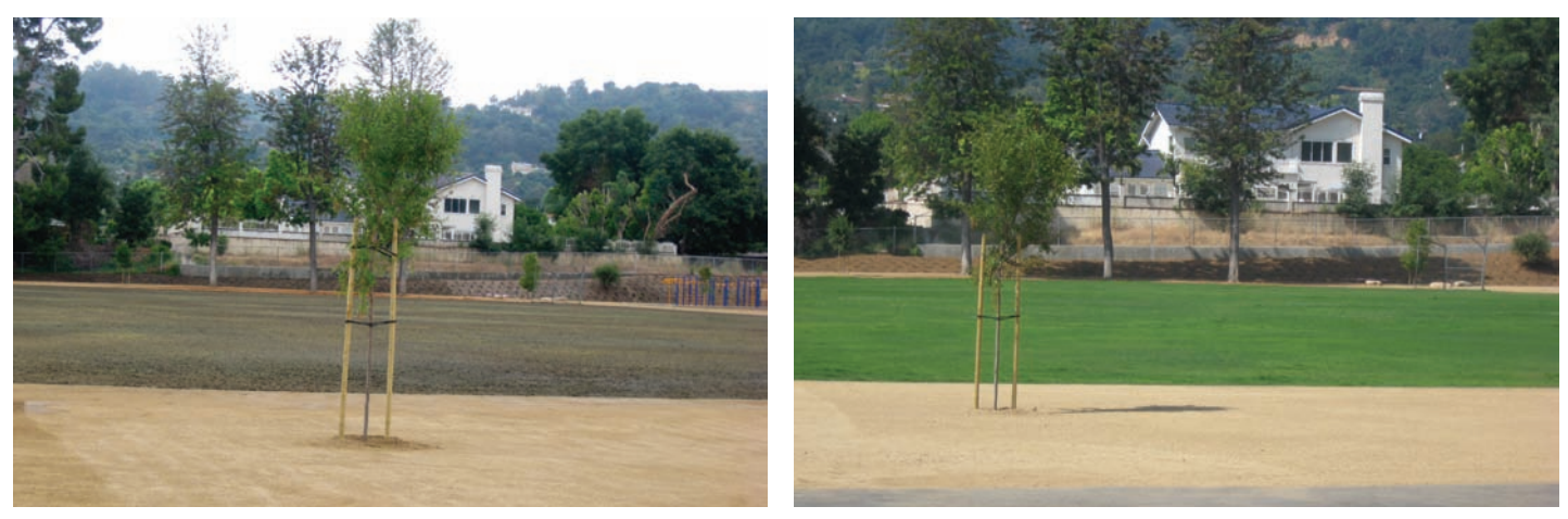
End uses of SoilPro Premium Compost include turf establishment, as illustrated in these before and after photos of an athletic field project.

diligent in ensuring that the IERCF's development and operation is economically, socially and ecologically sustainable. The fact that these materials are generated, processed and sold locally, reduce water consumption and protect ground and surface water resources, and represent a fair value to rate payers compared to other less economically and environmentally friendly options, such as disposal or long distance transport, combine to make the IERCA a great success.