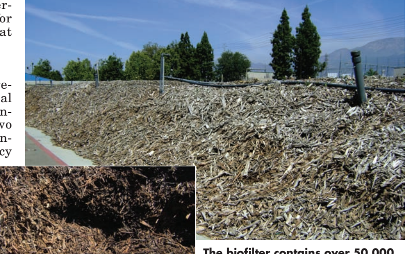
The biofilter contains over 50,000 cubic yards of chipped wood piled onto a perforated floor (inset). Designed air flow rate is 813,200 cubic feet/minute.

with neighboring land uses, compatibility with local zoning and public expectations for this type and scale of facility, and an architecture that allowed control of air emissions and odors. The entire property is 24.4 acres, and has a maximum security prison and a large retail warehouse facility as neighbors. The closest residence is a mile away. Another major advantage of the site is its location next to the IEUA's Regional Wastewater Treatment Plant No. 4. Sharing property with the treatment plant provided opportunities and efficiencies with resources, staffing, land and permits. The compost facility handles all of the solids pro-