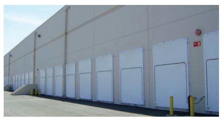
Trucks delivering biosolids and amendments drive into the building's receiving area through high-speed roll up doors that close immediately after they enter.

All air from inside the facility is also pulled by blowers through the biofilter. The negative flow of exhaust air is conveyed using a series of fans controlled by a SCADA (supervisory control and data acquisition) system. The SCADA system tracks all composting activity and records time and temperature conditions providing documentation required for meeting state and federal composting regulations. It also allows staff to operate facility equipment remotely, from front-end loaders or the floor. The entire facility is mapped out with wireless receivers that allow unrestricted access to SCADA controls within the facility. Recycled water is plumbed throughout the facility for use as